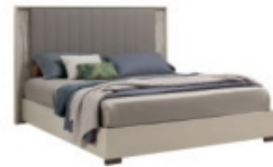
Q.S./UK 5" BED PJJPO150 (UK FIRE RETARDANT) PJJPO150I Inner size inch 61" x 80 3/4" - cm 155 x 205 inch W 67" D 85" H 55" cm L 168,9 P 214,7 H 140,3 Crts 2 kg 97 m 3 0,38