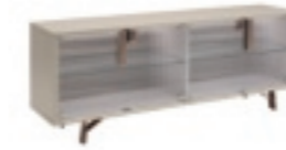
4/D BUFFET GLASS DOORS KJJP611 US LIGHT KIT PJJPO611 UK LIGHT KIT PJJPO612 EU LIGHT KIT PJJPO613 With 4 glass doors inch W 82" D 20" H 31" cm L 208,7 P 51,3 H 79,5 Crts 3 kg 98 m 3 0,97