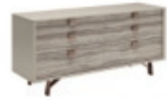
DRESSER KJJP120 With 6 drawers inch W 68" D 20" H 32" cm L 173 P 51,3 H 80,2 Crts 1 kg 94 m 3 0,74