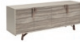
4/D BUFFET KJJP610 With 4 doors inch W 82" D 20" H 31" cm L 208,7 P 51,3 H 79,5 Crts 1 kg 107 m 3 0,9