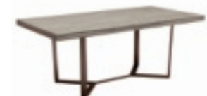
EXTEN. TABLE W250 PJJPO618 With 2 leaves w 20 1/2" cm 52 inch W 81"/122" D 41" H 30" cm L 205/309 P 105 H 76,3 Crts 3 kg 118 m 3 0,66