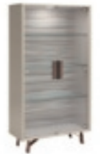
2/D CURIO CABINET KJJP681 US LIGHT KIT PJJPO681 UK LIGHT KIT PJJPO682 EU LIGHT KIT PJJPO680 With 2 glass doors inch W 39" D 17" H 73" cm L 99,6 P 42 H 185,8 Crts 3 kg 108 m 3 1