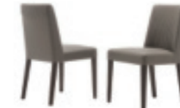
2 CHAIRS KJJP620 2 CHAIRS (UK FIRE RETARDANT) KJJP620I With bronze high gloss structure, seat and back in ecoleather inch W 20" D 22" H 34" cm L 51 P 57 H 87 Crts 1 kg 17 m 3 0,46