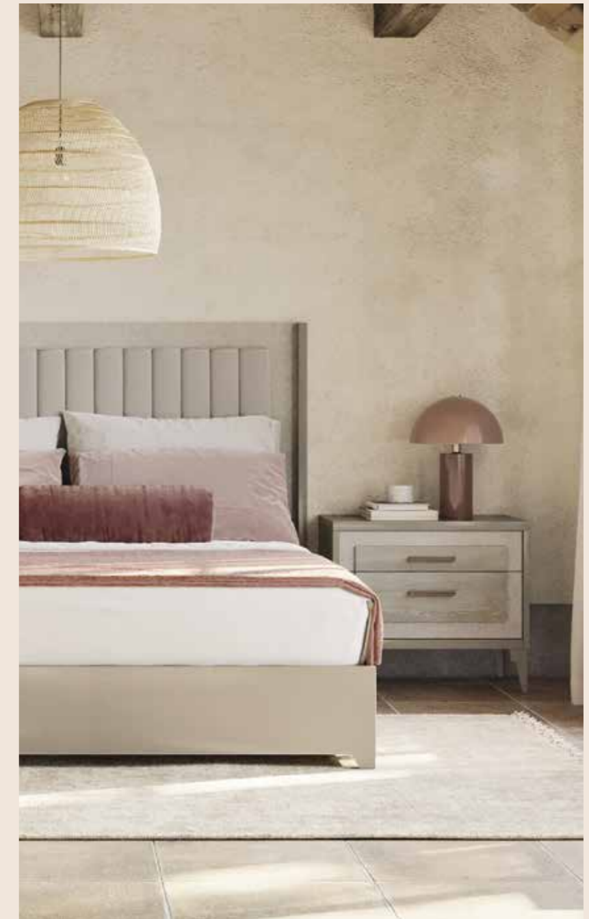
Ellen bedroom set, tuscan interior

Теплые оттенки и нежные тона характеризуют дизайн Ellen, наполняя спальню манящей аутентичностью, напоминающей о тосканском фермерском доме. Архитектурное вдохновение проявляется в изысканных деталях, таких как ритмичные узоры мягкого изголовья и глубина выдвижных ящичков.