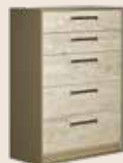
5/DRW. CHEST KJJO117

inch W 28" D 18" H 26" cm L 71,2 P 45 H 67 Crts 1 kg 36 m 3 0,29