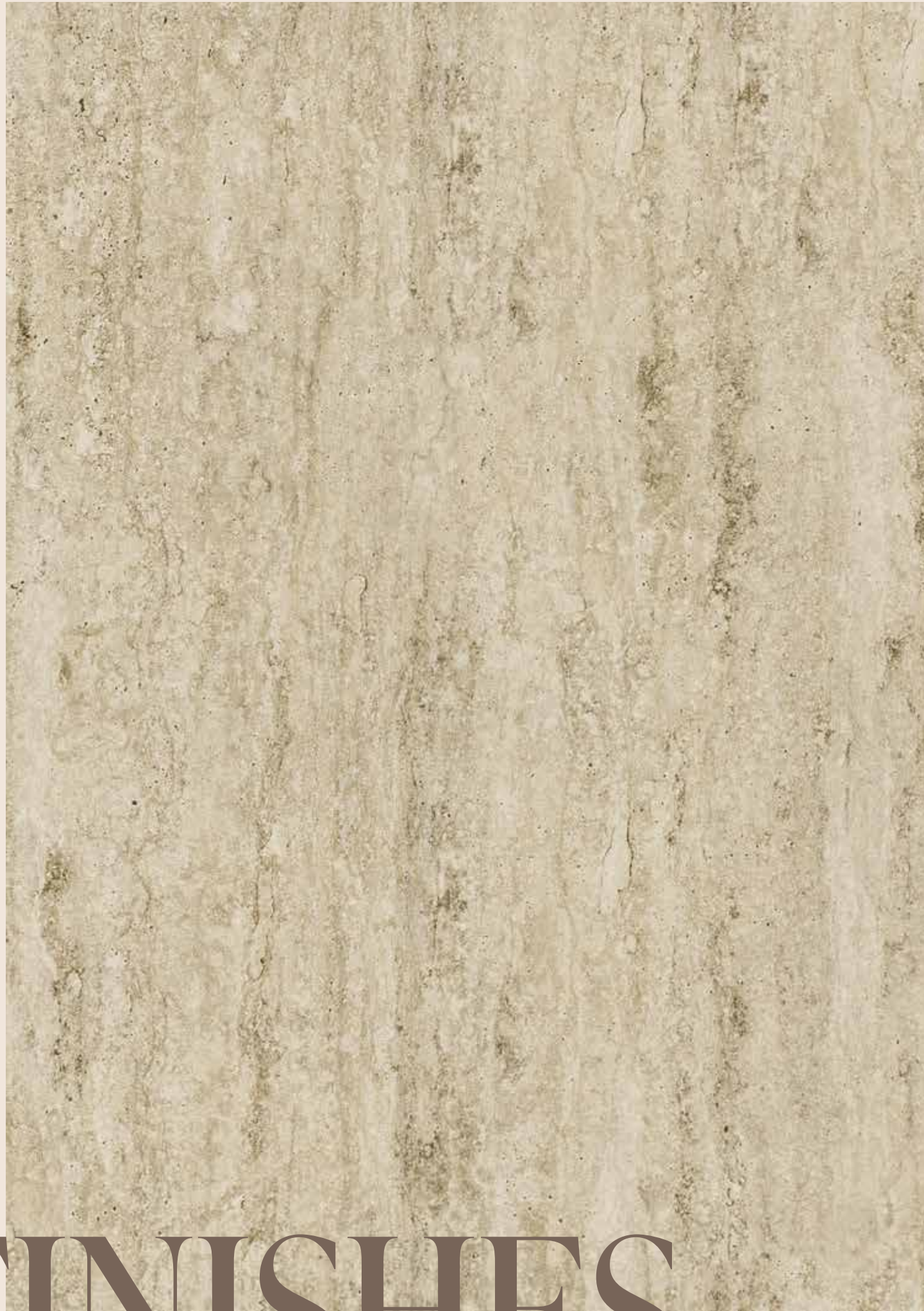
TRAVERTINO ECO STONE