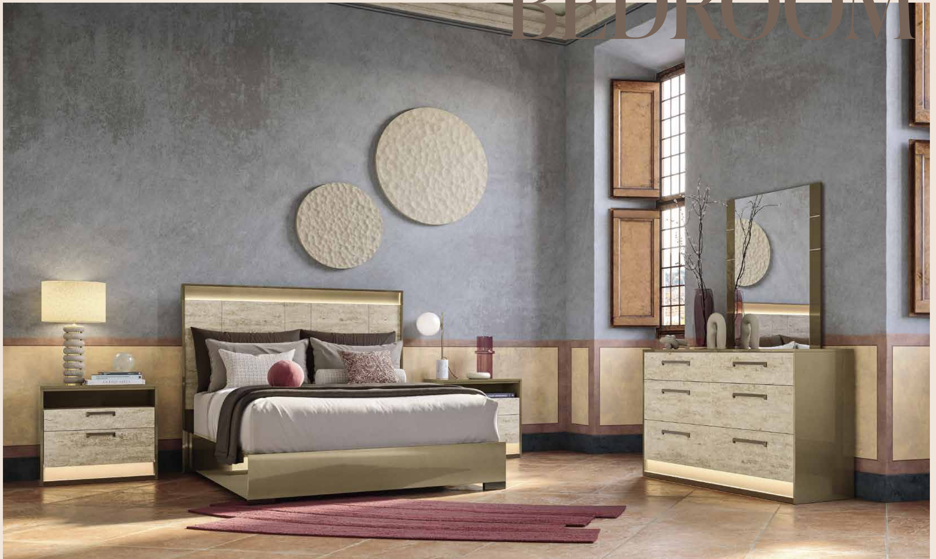
Jo bedroom set, roman interior