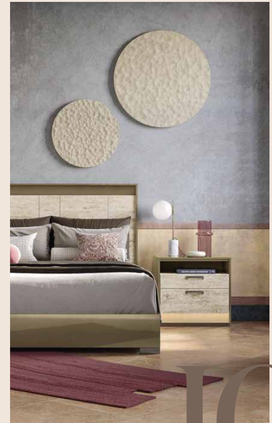
Jo bedroom set, roman interior

В спальне Jo's тактильное богатство травертина дополняется драгоценной эссенцией золота. Симфония роскошных тонов сходится в элегантном дизайне, где гладкие плоские поверхности плавно сменяются освещенными нишами.