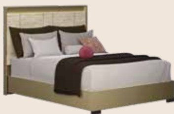
Q.S./UK 5" BED PJJ00150