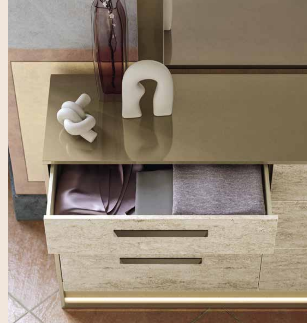
Jo bedroom set, roman interior