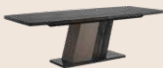
EXTEN. TABLE W250 PJPC0615

inch W 68" D 20" H 33" cm L 173,5 P 51,3 H 85 Crts 1 kg 97 m 3 0,8