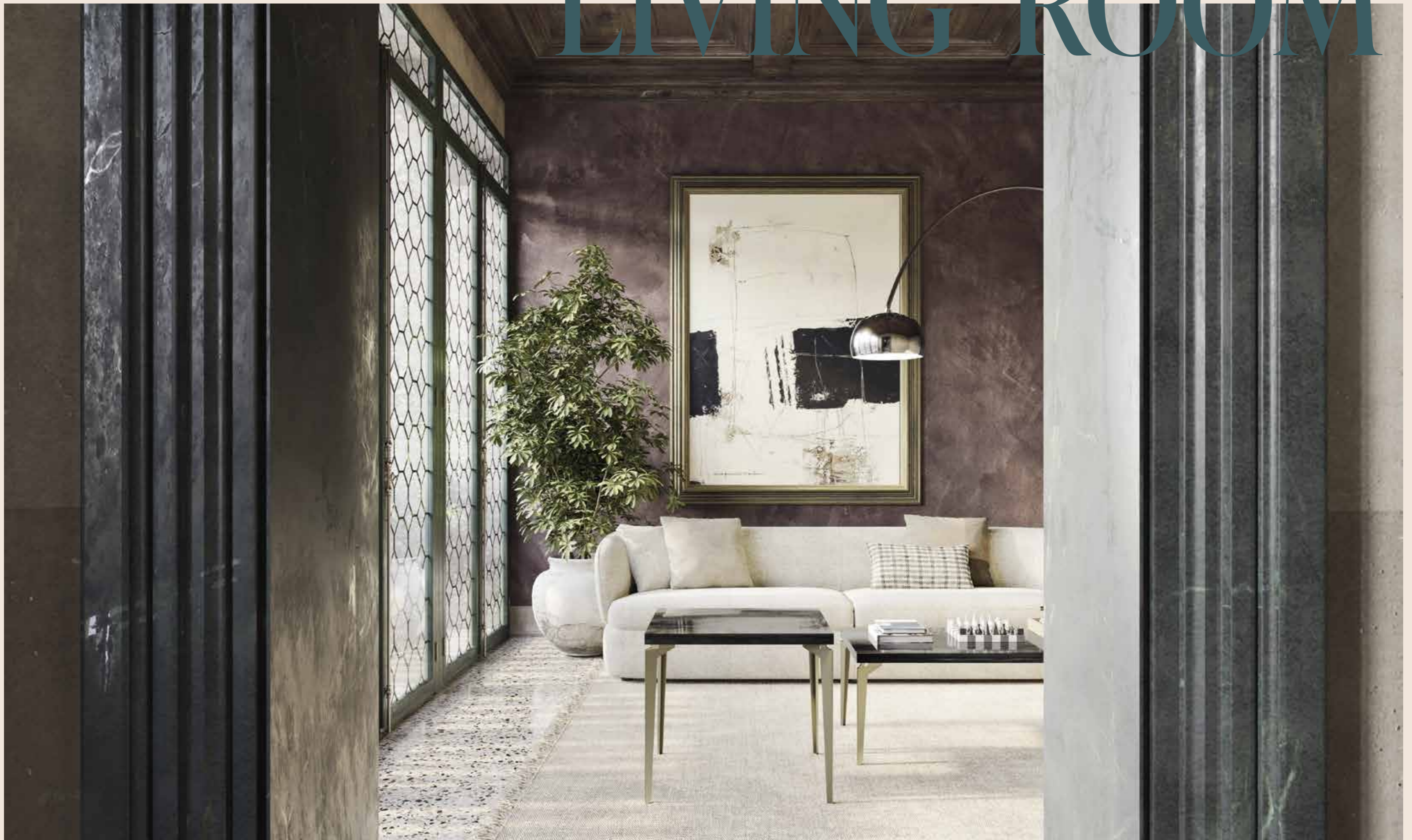
Picasso living room set, venician interior