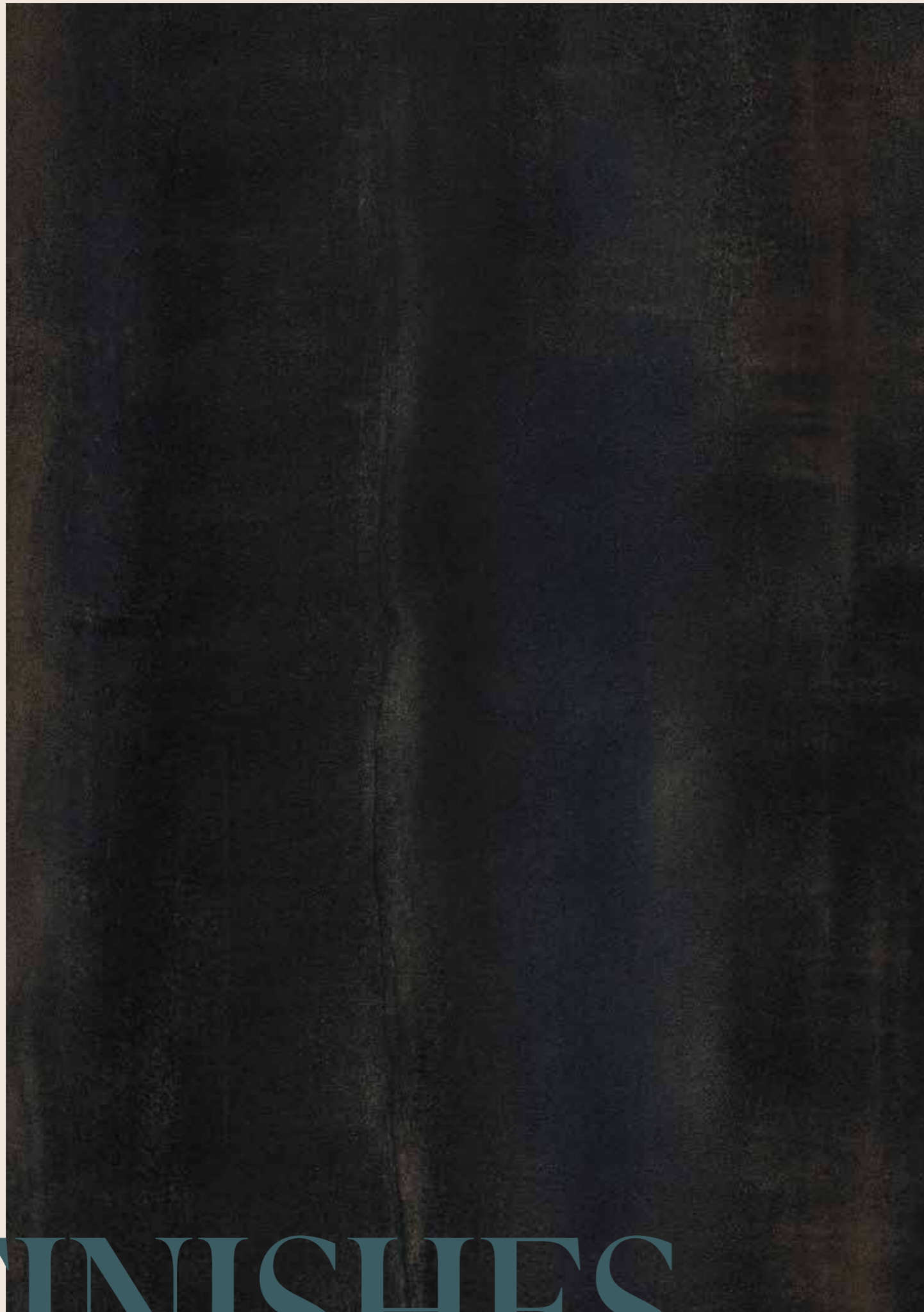
OXIDE FINISH HIGH GLOSS