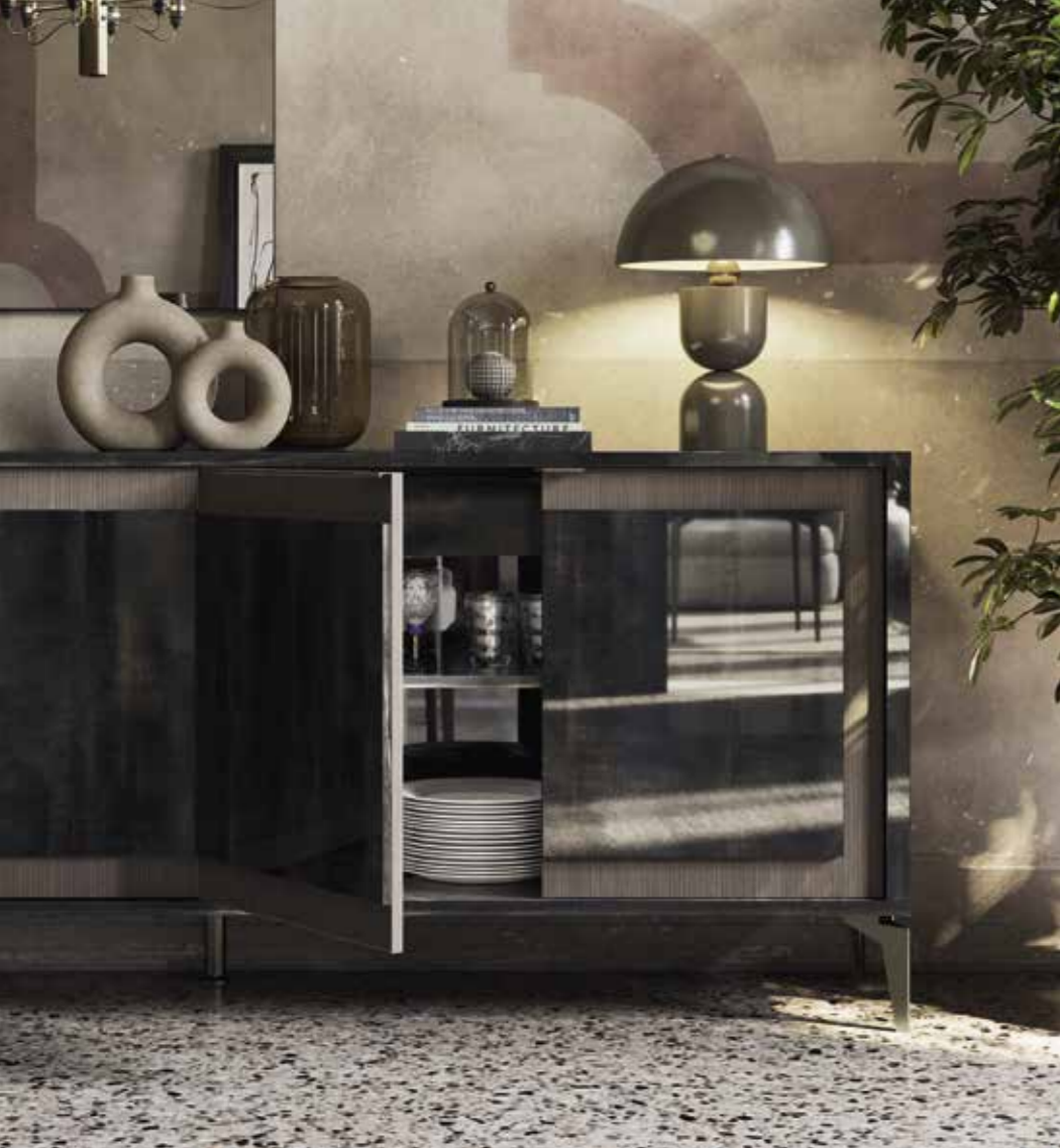
Picasso dining room set, venician interior