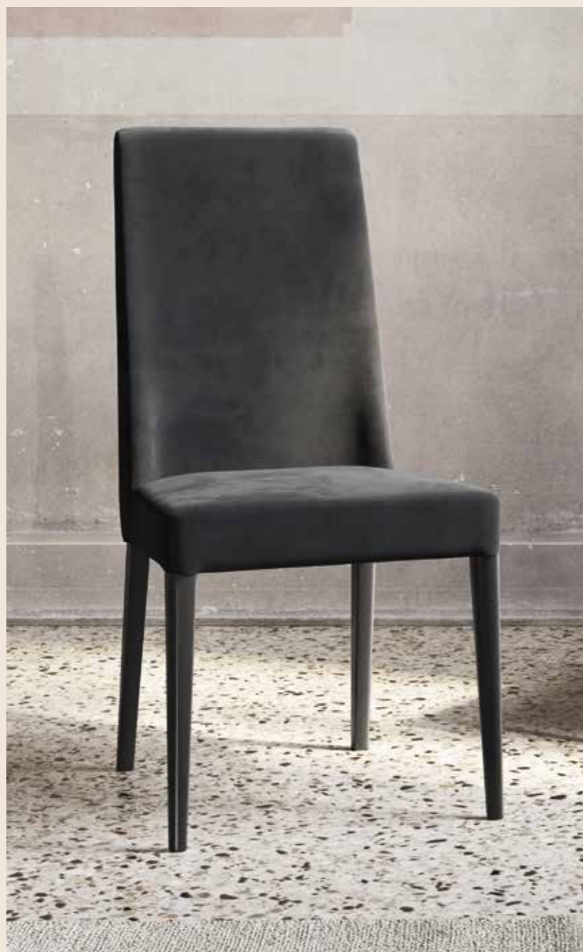
Picasso dining room set, venician interior

The Picasso table, with its graceful curves, magnifies the mesmerizing reflections of the oxidized wood finish. The table's base exudes dynamism, featuring a pronounced inclination and a delightful interplay between the oxidized and ribbed finishes.