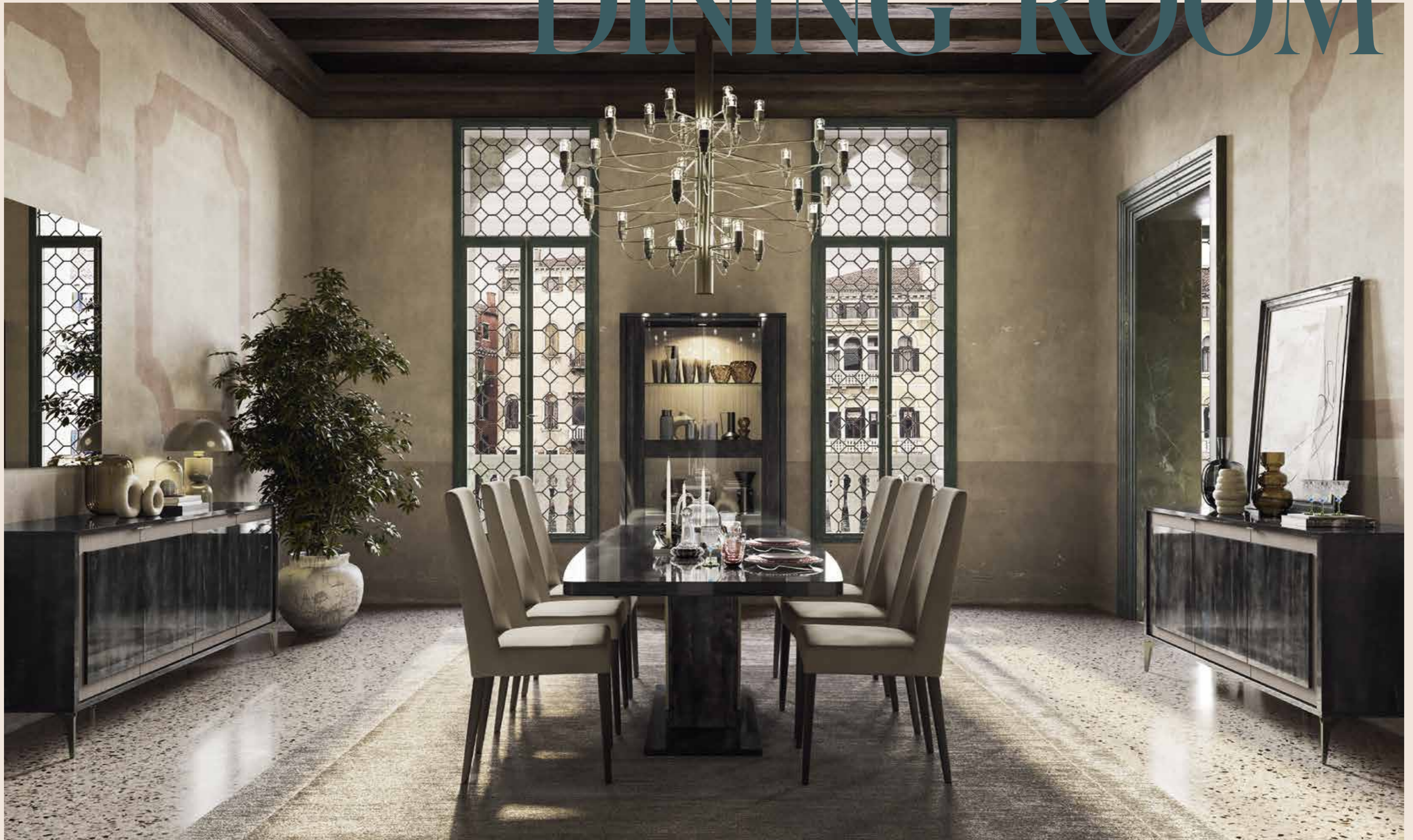
Picasso dining room set, venician interior