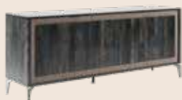
4/D BUFFET KJPC610