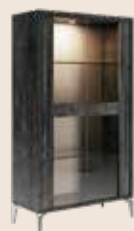
2/D CURIO CABINET

inch W 83" D 37" H 29" cm L 210 P 95 H 74,2 Crts 2 kg 105 m 3 0,86